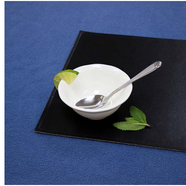
BS-A7 | 7.4 oz (230 ml) 12 units / case