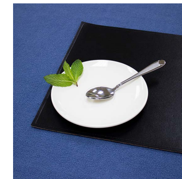
SAP-78 | 6.5" (16.5 cm) 12 units / case