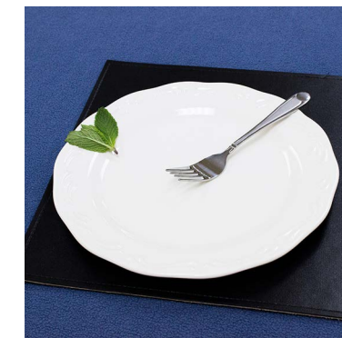
SR-10 | 9.5" (24 cm) 12 units / case