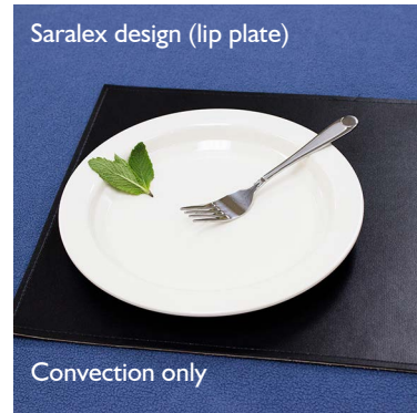
PLNI-24-NR | 9" (23 cm) 24 units / case