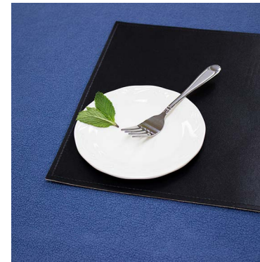
SR-6 | 5.5" (14 cm) 12 units / case