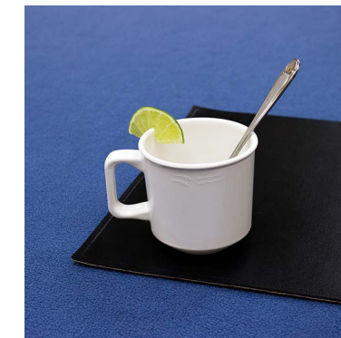
SAP-10 | 10 oz (310 ml) 12 units / case