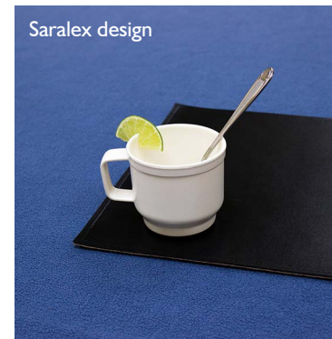
SAM-8 | 8 oz (250 ml) 24 units / case