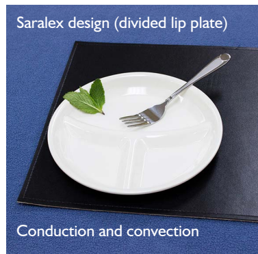
PLI8-3-24-NR | 8" (20.5 cm) 24 units / case