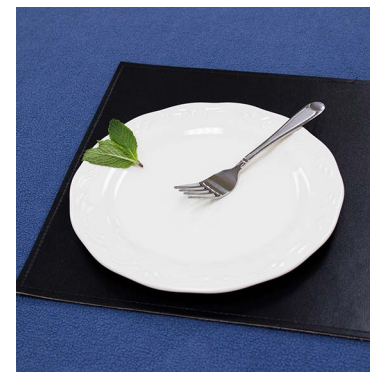
SR-9 | 8.5" (21.5 cm) 12 units / case