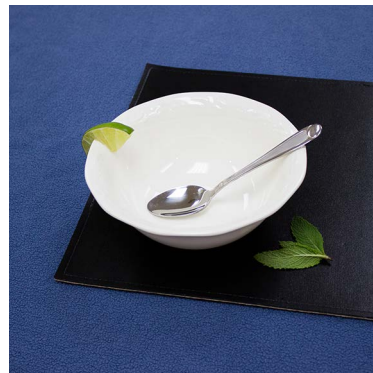
BS-D7 | 21 oz (660 ml) 12 units / case