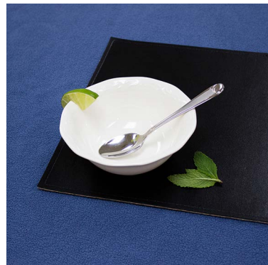
BS-D6 | 14 oz (440 ml) 12 units / case