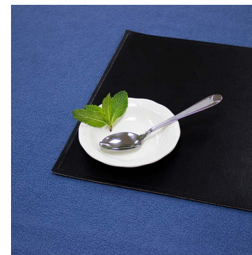
SAM-78 | 4" (10 cm) 24 units / case