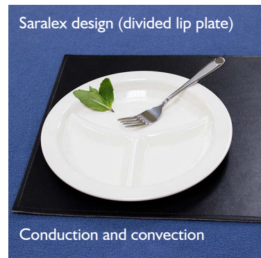
PLNI-3-24-NR | 9" (23 cm) 24 units / case