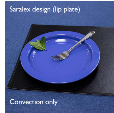
PLJ-24-NR | 9" (23 cm) 24 units / case