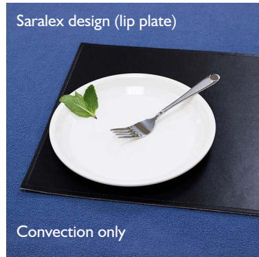
PLI8-24-NR | 8" (20.5 cm) 24 units / case