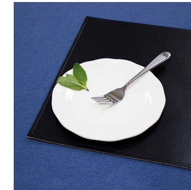
SR-7 | 6.5" (16.5 cm) 12 units / case