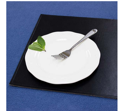
SR-8 | 7.5" (19 cm) 12 units / case