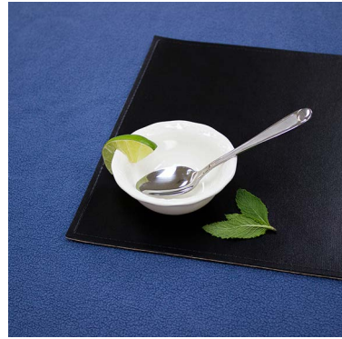
BD-A5 | 4 oz (120 ml) 24 units / case